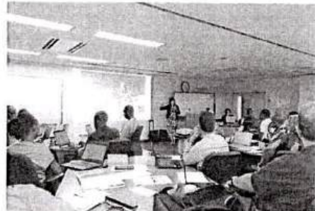
Lecture on 5S activity