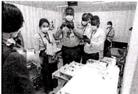
Site visit at the hospital in Japan (Observation of 5S -KAIZEN activities)