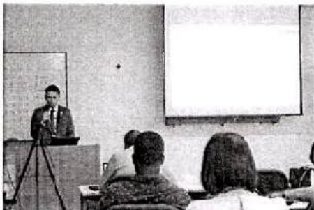
Presentation of action plan by the participants