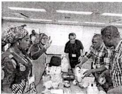
Practical session of 5S activity