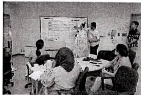
Practical session on KAIZEN with QC Story