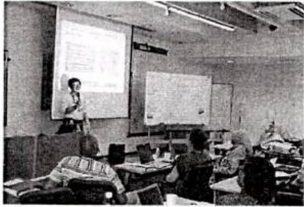
Lecture on Healthcare System of Japan