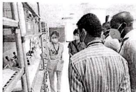
Site visit at the hospital in Japan (Observation of 5S -KAIZEN activities)